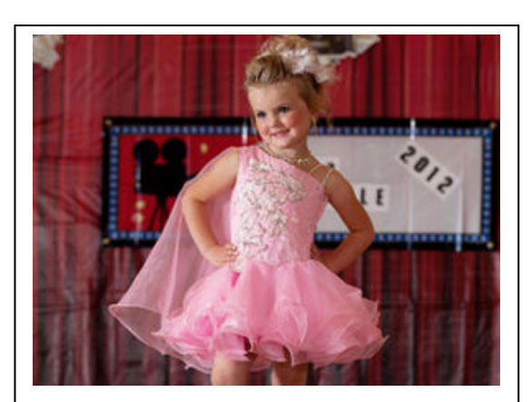
TODDLERS IN SWIMWEAR AND MAKE-UP, DISTURBING CHILD PAGEANTS COME TO BRITAIN Daily Express, 4 September